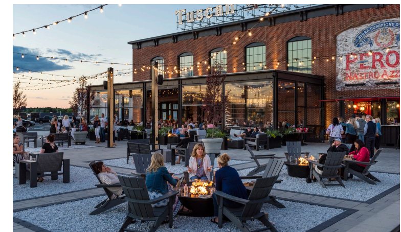
Firepit Gathering Area