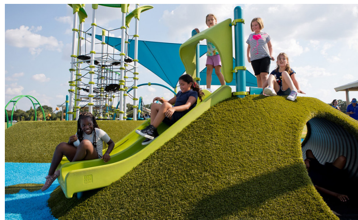
Play Mound + Slide